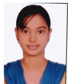
Signature of the Stu